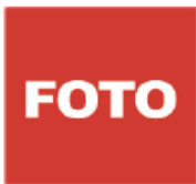
FOTO is a Greater Benefit when the Patient Uses the Computer or Tablet